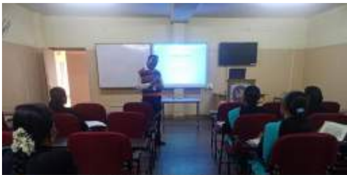
62VF4P26, Thimlapura, Karnataka 577427, India Thimlapura Karnataka India 25°C 77°F 2022-07-19(Tue) 10:23(am)