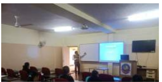
63VF4P20, Thimlapura, Karnataka 577427, India Thimlapura Karnataka India 25°C 77°F 2022-07-19(Tue) 10:21(am)